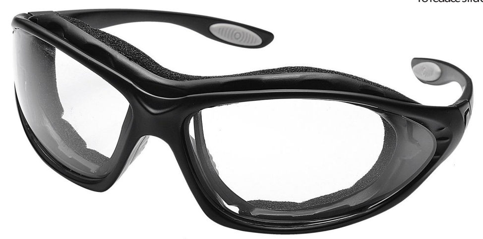
Soft Nose Tips •Toreduceslide